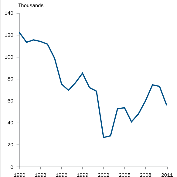
Figure 1. Refugee Admissions to the United States: 1990 to 2011

Source: U.S. Department of State, Bureau of Population, Refugees, and Migration (PRM), Worldwide Refugee Admissions Processing System (WRAPS).