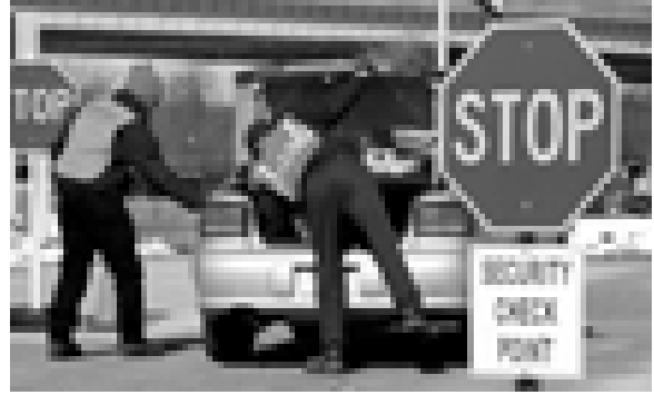
Security inspection at Harrisburg, Pennsylvania airport.