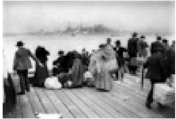
Immigrants arrive at Ellis Island.